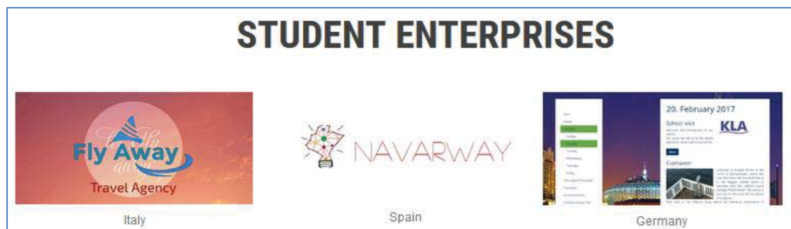
Figure IO3_5_2: Student companies in Italy, Spain and Germany (Erasmus+, project PACE, see https://blogs.uni-bremen.de/pace/ )